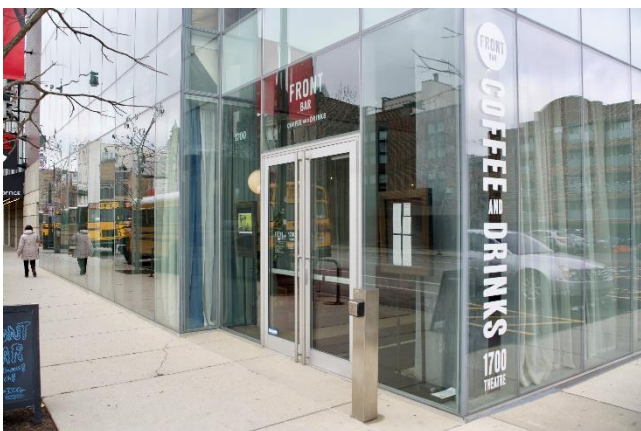
Front Bar Entrance – 1700 N. Halsted