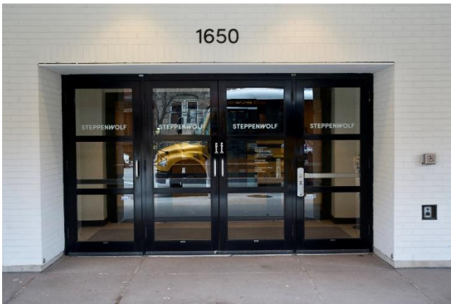
Main Lobby Entrance – 1650 N. Halsted