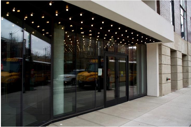
Ensemble Theatre Entrance – 1646 N. Halsted

There are three different entrances into the theater from the street: the Ensemble Theatre Lobby entrance, the Main Box Office Lobby entrance and the Front Bar entrance.